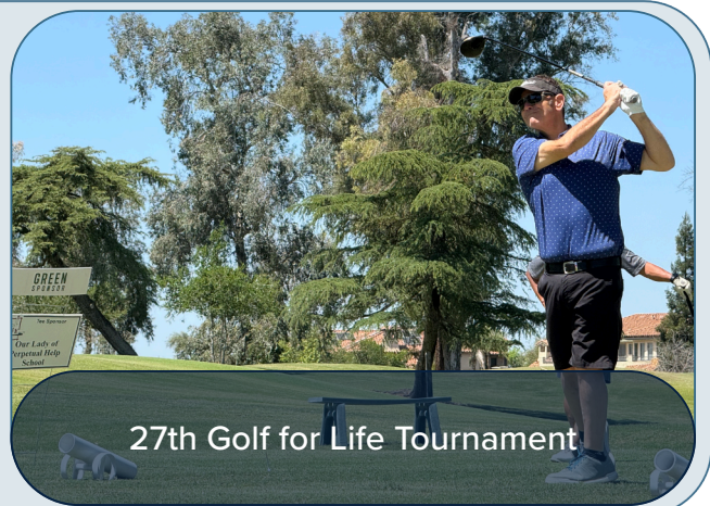
27th Golf for Life Tournament

Whether you're a golfer, a sponsor, a volunteer, or someone who just wants to see the day succeed, there's a place for you in the lineup.