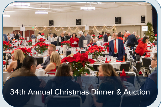
34th Annual Christmas Dinner & Auction

Whether you have auction items to donate, skills to lend, or time to give, there's a role for you behind the scenes of something truly special.